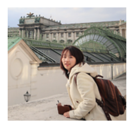
Siriguna, China, participant of the univie: winter school for Cultural Historical Studies